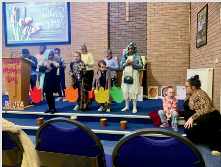
Mother's Day Children's presentation at Dingle Mount Church