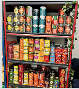
Food items given out