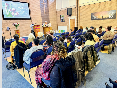
Dingle Mount Church Mother's Day service