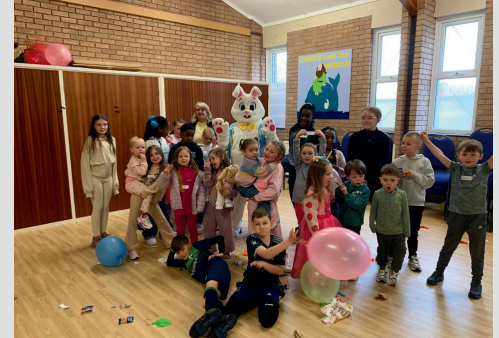
Children's Easter Outreach party at Dingle Mount Church