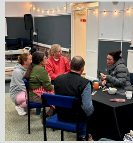
Hope Church outreach