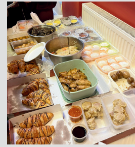
Gladness Christian Fellowship meal